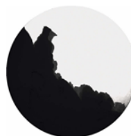
standard powder (Images from a powder rheometer)

Test methods are flow rate measurements with orifice plates and rheometers for powders.